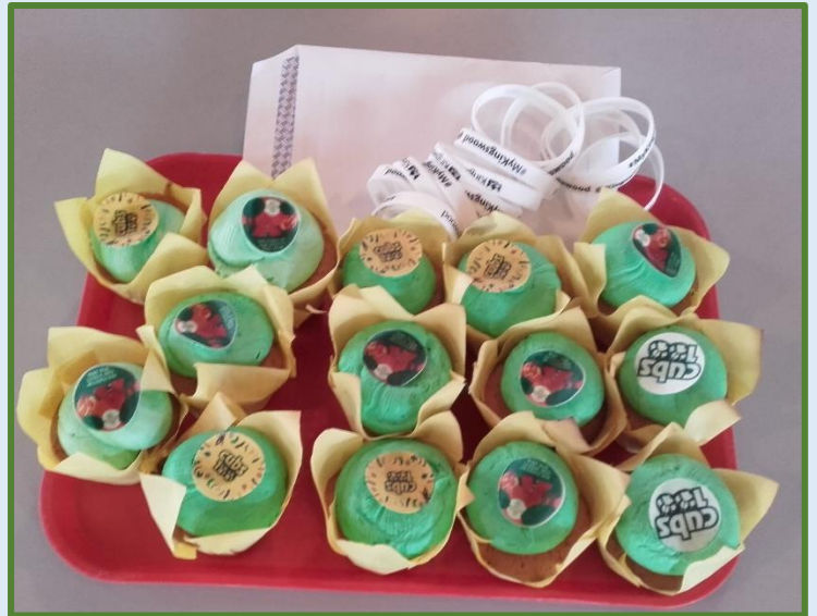
Scrummy Yummy, green icing!