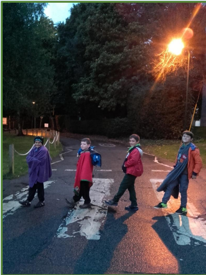
Being of a certain age I couldn't resist this shot.