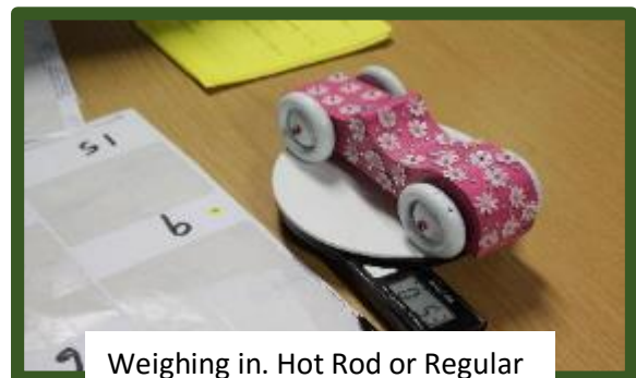
Weighing in. Hot Rod or Regular