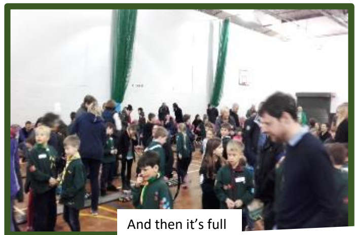
And then it's full