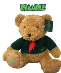
Cubs Bramble Bear with Certificate £15.00