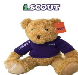
i.Scout Bear with Certificate £15.00

Create your own story with our three bears.