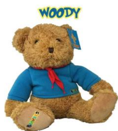
Beavers Woody Bear With Certificate £15