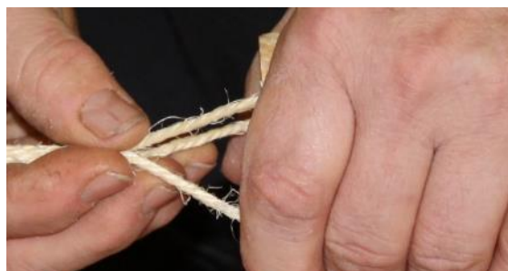
Making Rope, an all-time favourite, and useful too.