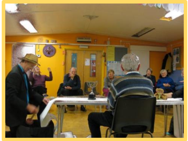
Hi Tech conveyor belt: a roll of paper pulled across a table. Well it worked!

Could you mime Emmerdale in Give Us A Clue? Neither could we!