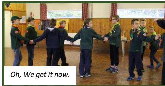
Oh, We get it now.