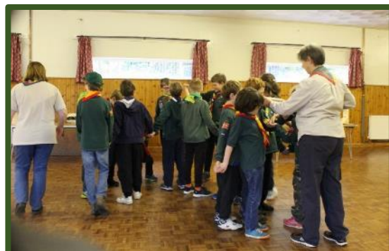
Confusion reigns with the human knotting game

In their groups, they were asked to make a human knot by crossing their arms and linking up with another 2 cubs in their group, they then had to un-knot themselves without letting go of the other cubs.