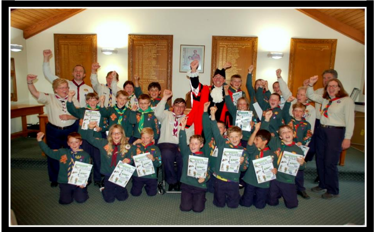
Cubs with their leaders celebrate receiving the Chief Scout Silver Award Lots of work from all concerned

As an old scout himself he remembered fondly his time in scouts especially a particular wide game his troop played.