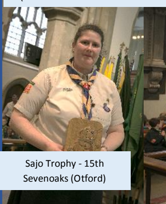
Sajo Trophy - 15th Sevenoaks (Otford)