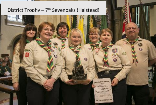
District Trophy – 7 th Sevenoaks (Halstead)